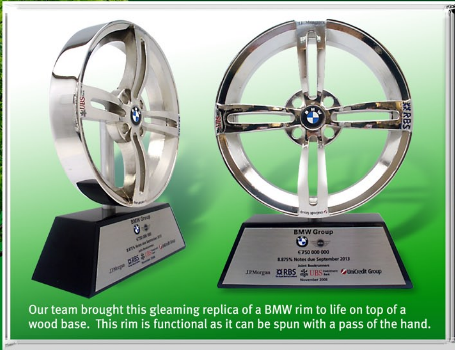
Our team brought this gleaming replica of a BMW rim to life on top of a wood base. This rim is functional as it can be spun with a pass of the hand.