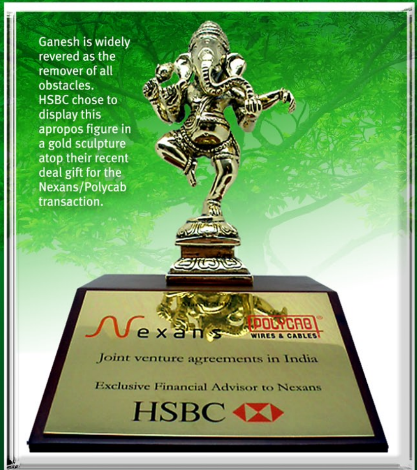
Ganesh is widely revered as the remover of all obstacles. HSBC chose to display this apropos figure in a gold sculpture atop their recent deal gift for the Nexans/Polycarb transaction.

Stephen Sokoler ssokoler@iconrecognition.com T: 646.845.8950