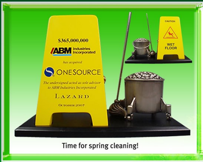
Time for spring cleaning!