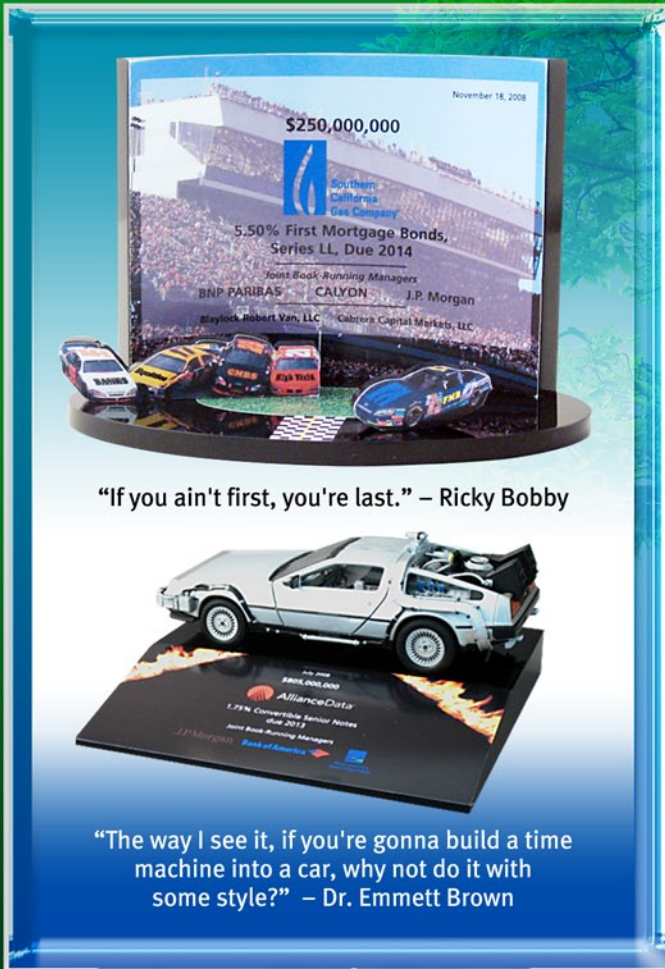
"If you ain't first, you're last." – Ricky Bobby