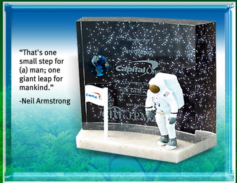
"That's one small step for (a) man; one giant leap for mankind." -Neil Armstrong