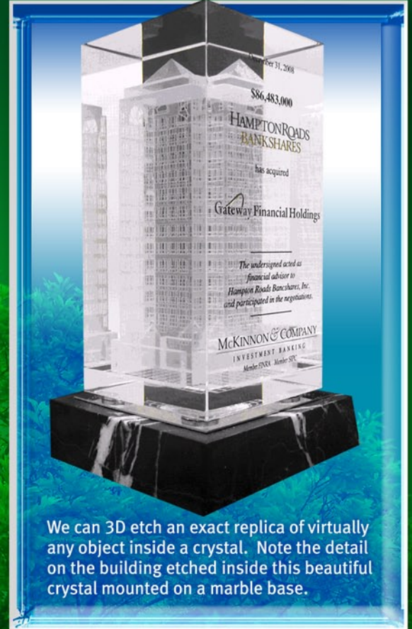
We can 3D etch an exact replica of virtually any object inside a crystal. Note the detail on the building etched inside this beautiful crystal mounted on a marble base.