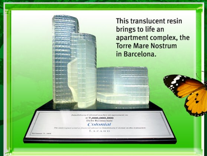
This translucent resin brings to life an apartment complex, the Torre Mare Nostrum in Barcelona.