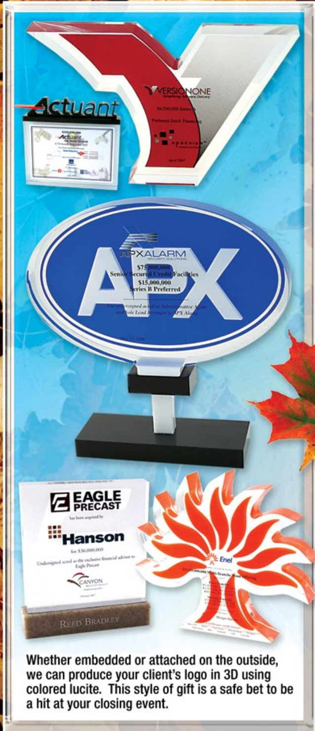
Whether embedded or attached on the outside, we can produce your client's logo in 3D using colored lucite. This style of gift is a safe bet to be a hit at your closing event.