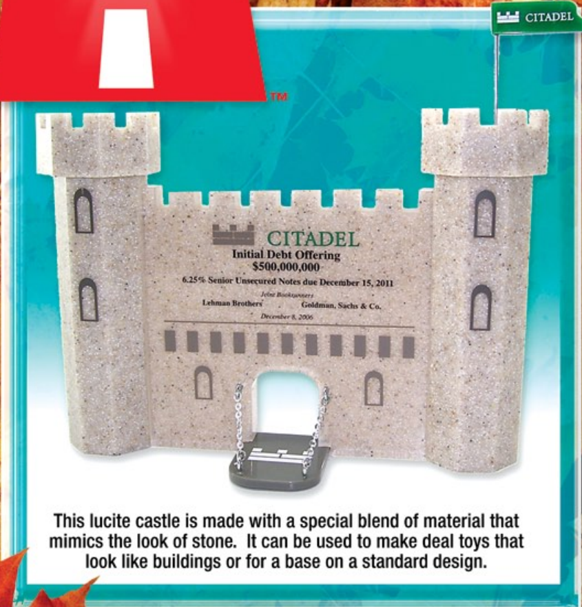
This lucite castle is made with a special blend of material that mimics the look of stone. It can be used to make deal toys that look like buildings or for a base on a standard design.